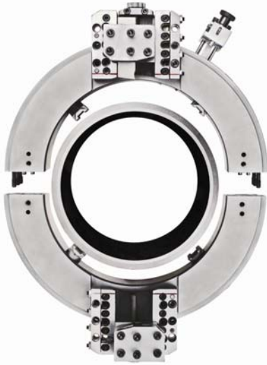
Figure 3. State of the art in parting and beveling is the Wachs Split Frame line, so named for its ability to split in half for O.D. mounting to inline pipe.