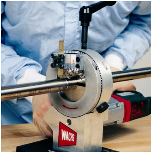
Figure 5. Many Wachs tools are designed to produce a distinct curled chip, to minimize airborne contaminates.