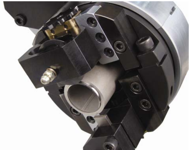
Figure 6. FME Modules (Foreign Material Exclusion) are available to control chips, particles and other debris from the machining process.