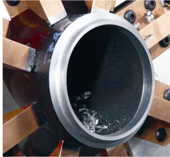
Figure 4. The "J" weld prep is more forgiving than single bevels, is often specified by automatic orbital welding system manufacturers and can only be produced by machining.