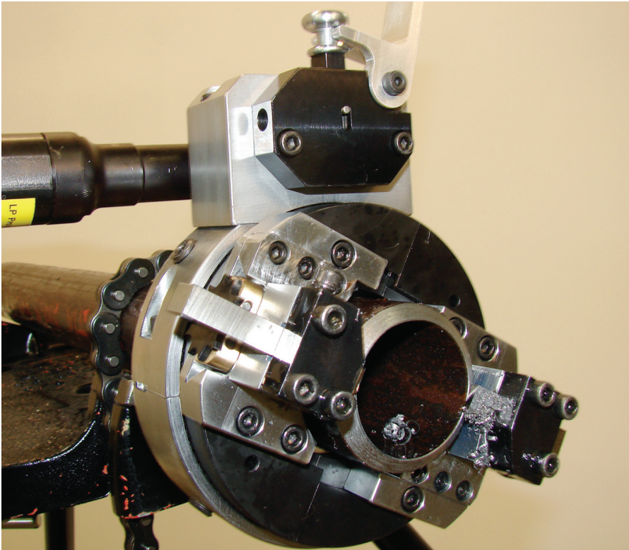
Fig. 2 — OD-mounted split frame machine tool with air drive shown simultaneously parting (cutting) and beveling a standard 37.5-deg weld prep. Note the lathe-quality finish ready for welding.

eration and minimize or totally eliminate defects and rework. By contrast, not taking steps to properly machine the required weld prep can cause gaps and mismatches, and may result in either overwelding or poorly executed, unsuitable welds. In the best case this leads to increases in material spoilage and higher labor costs (due to reworking). In the worst case it can lead to contamination considerations or a catastrophic failure, all with high potential liability risks.